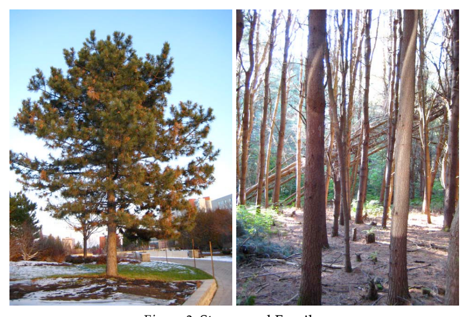
Figure 2. Strong and Fragile

Natalie further responds with a series of photographs and adjectives, which illustrate the opposing characteristics of trees (see Figure 2).