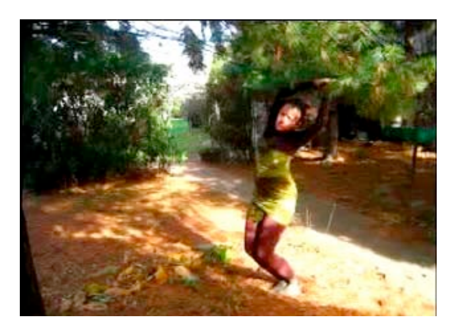
Figure 4. Video still from "a sense of place and being" (View at: <a href="http://www.motionquest.com/vinesy.mov">http://www.motionquest.com/vinesy.mov</a>; Belle and Sebastian, 2002, Music used with permission)

on the third temporal dimension of Ekstasis. The fusing of her present and future self. The anticipated cadence never arrives, yet is perpetually arriving. Being a teacher cannot be considered without the notion of becoming a teacher. One is continually becoming and recreating becoming. In being we are; in becoming we are happening.