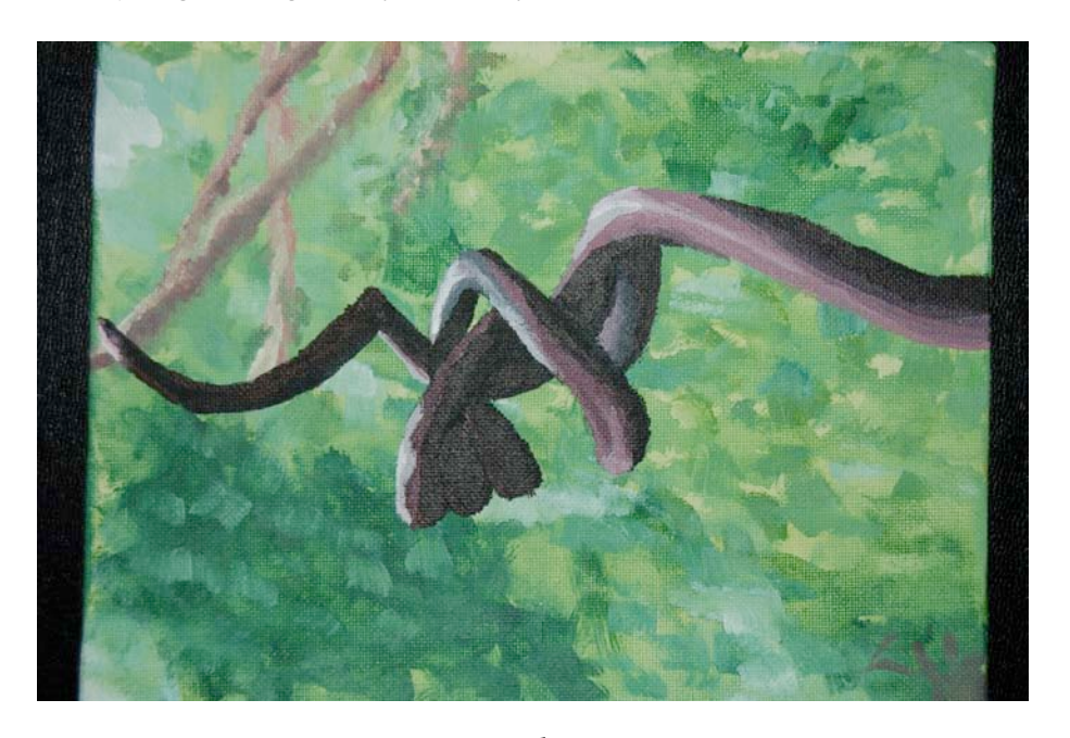
Figure 3. The Vine