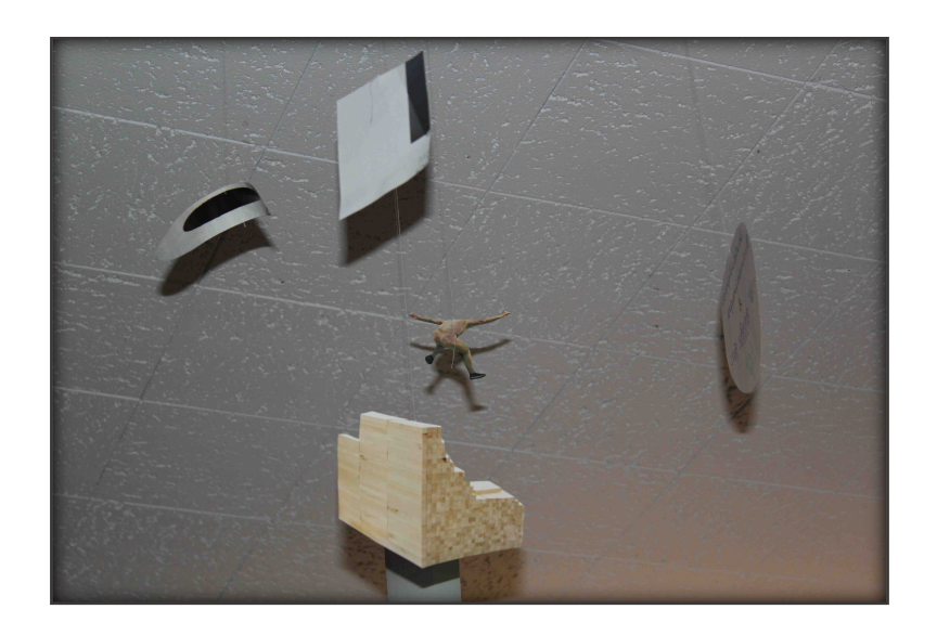
Geneviève Cloutier (2012). Cut-Outs. Digital photograph.