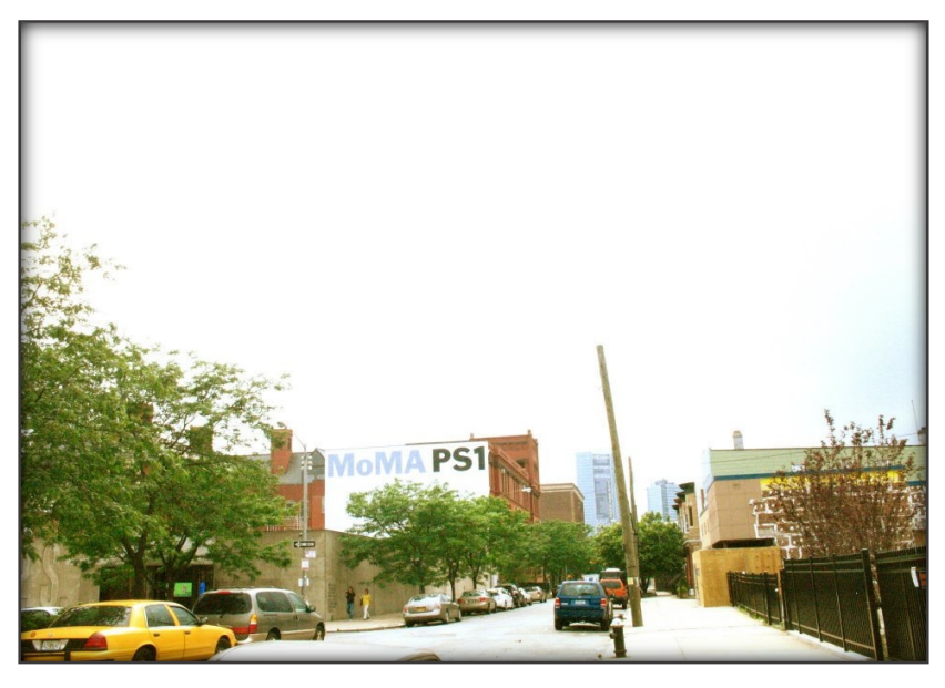
Geneviève Cloutier (2013). MoMAPS1. Digital photograph.

Canadian multi-disciplinary artist Janet Cardiff's installation 40 Part Motet, for example, follows me, stays with me. I remember romping around New York City, stumbling upon Cardiff's work at the MoMA PS1, an affiliate of The Museum of Modern Art in Long Island City. In the burrows of Queens, a graffiti wall shines across the street. Then, alone in the great big white room, I stood with a multiplicity of voices, different tonalities, and diverse volumes—surrounded by speakers presenting songs and chorals documented from another time and place. Memory skips as the same piece is experienced at the National Gallery of Canada in Ottawa one year later.