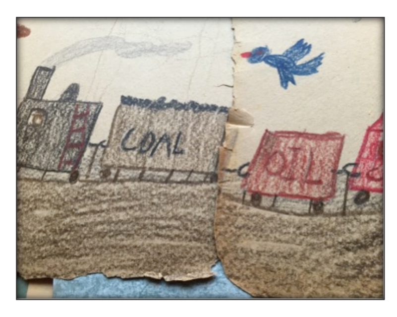
Cynthia Morawski (n.d.). Railroad Cars. From elementary school portfolio.