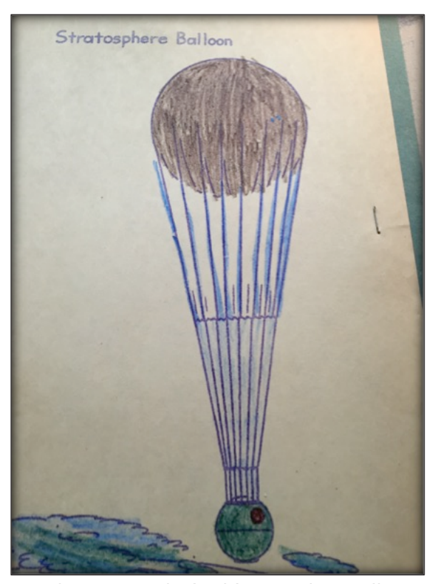
Cynthia Morawski (n.d.). Weather Balloon. From elementary school portfolio.

With the sharing of each composition, including students' explanations for their choice of materials, a rich array of unique expressions of completed stories emerge among the class. What would have happened if the tables had been bare? Would any of the students' stories have appeared?