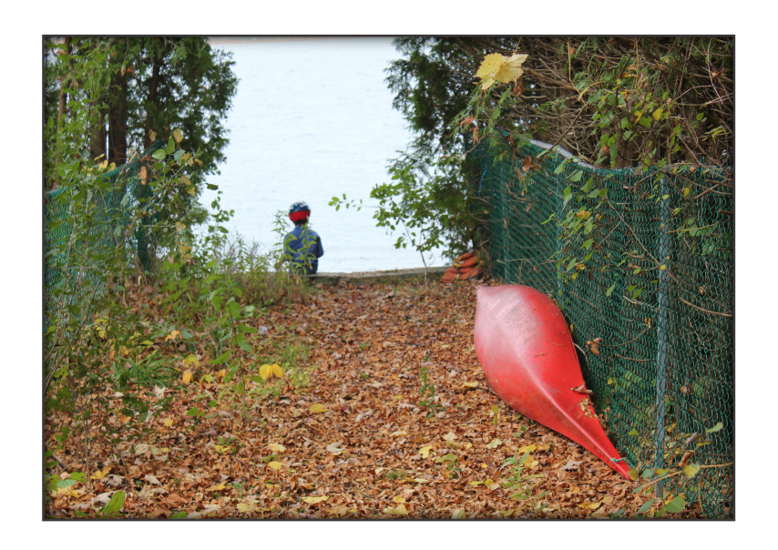
Geneviève Cloutier (2011). By a River. Digital photograph.